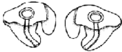
Right and left earmolds

The ear mould is a plastic or silicone insertion designed to conduct the amplified sound from the hearing aid receiver into the ear canal and to the tympanic membrane.